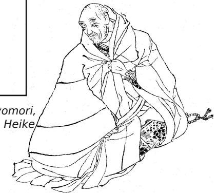
Taira no Kiyomori, head of the Heike clan